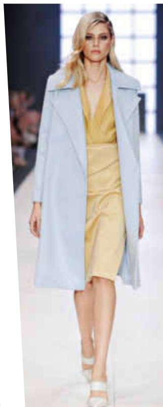
CAMEO THE LABEL