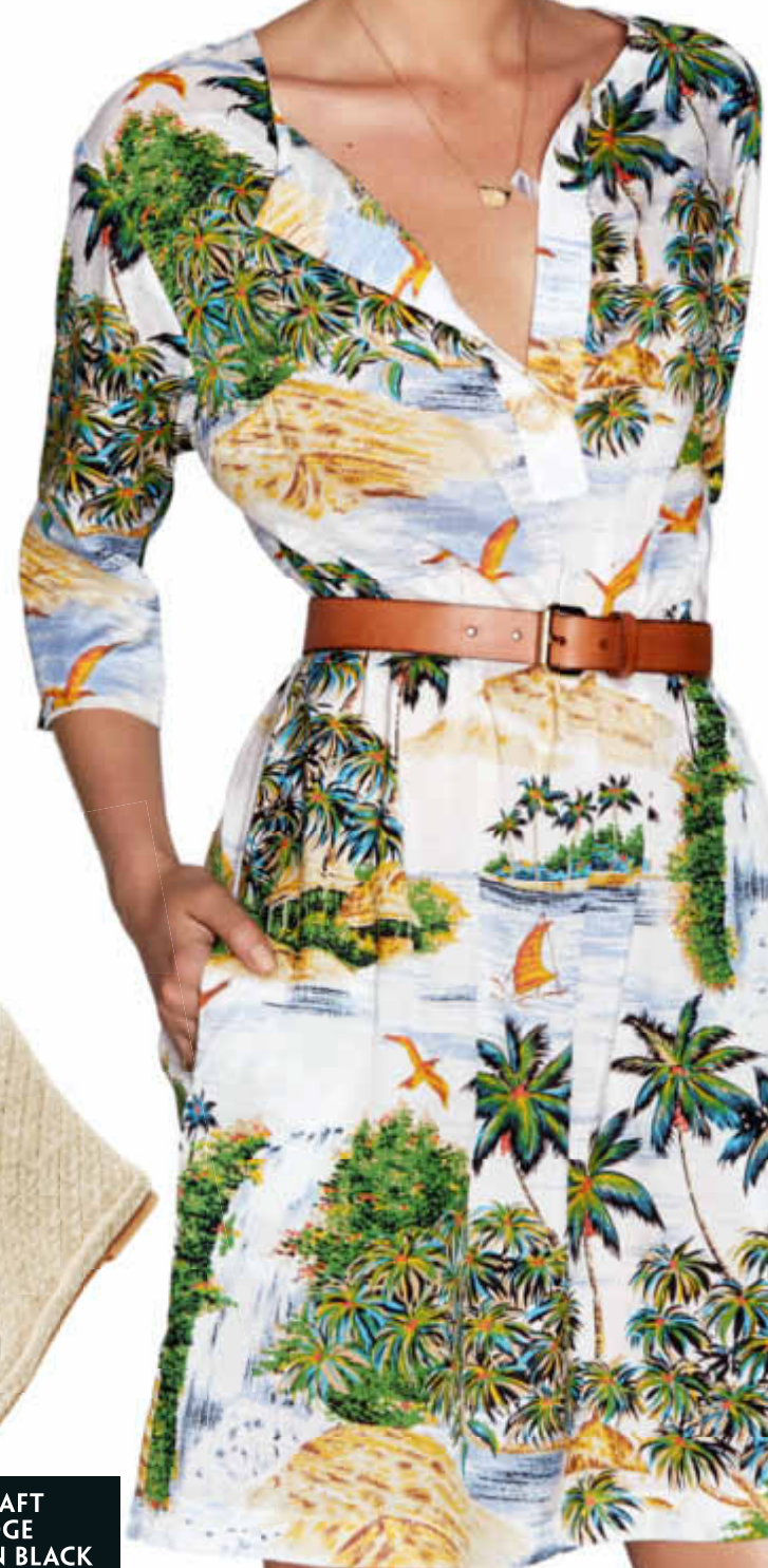
COLLETTE BY COLLETTE DINNIGAN GOA PALM PRINT PLACKET SHIRT DRESS \ $289