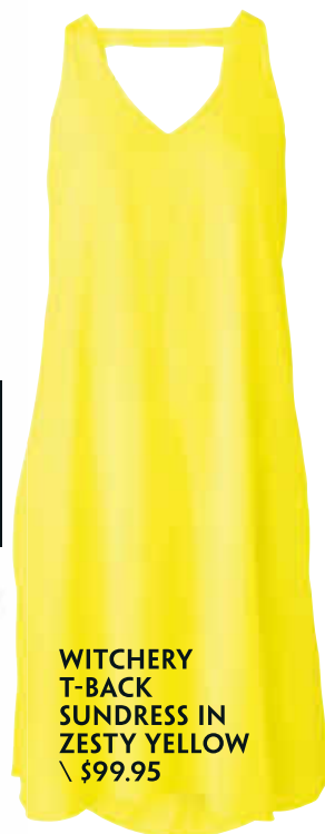
WITCHERY T-BACK SUNDRESS IN ZESTY YELLOW \ $99.95