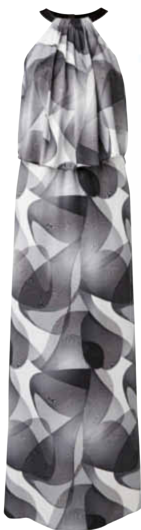
WITCHERY OVERLAY MAXI DRESS IN COOL GREY \ $179.95