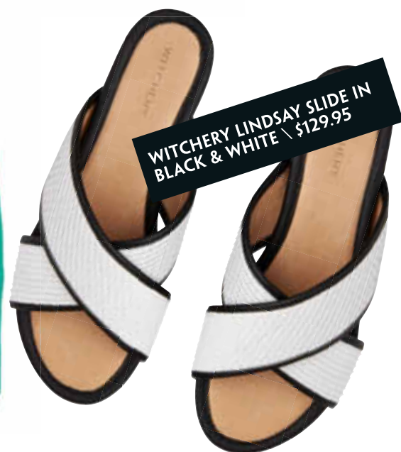
WITCHERY LINDSAY SLIDE IN BLACK & WHITE \ $129.95