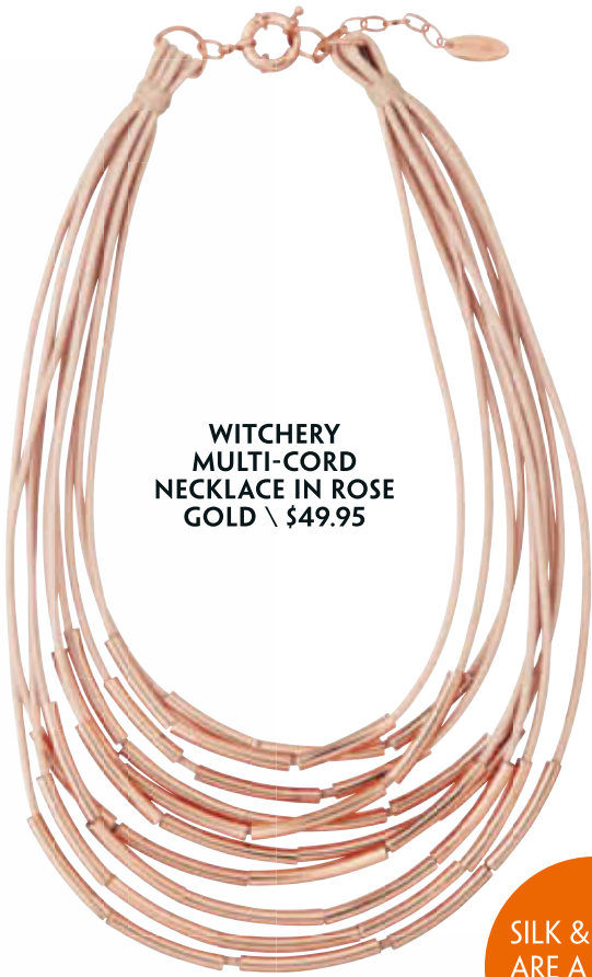
WITCHERY MULTI-CORD NECKLACE IN ROSE GOLD \ $49.95