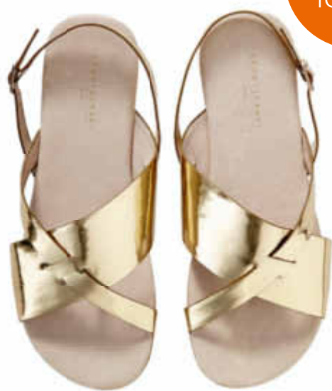
SPORTSCRAFT BRAVA METALLIC SANDAL IN GOLD \ $99.95