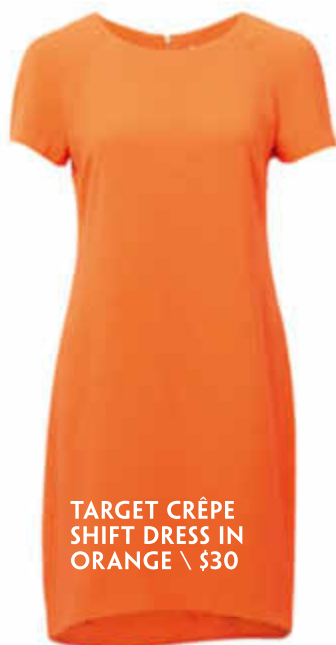
TARGET CRÊPE SHIFT DRESS IN ORANGE \ $30