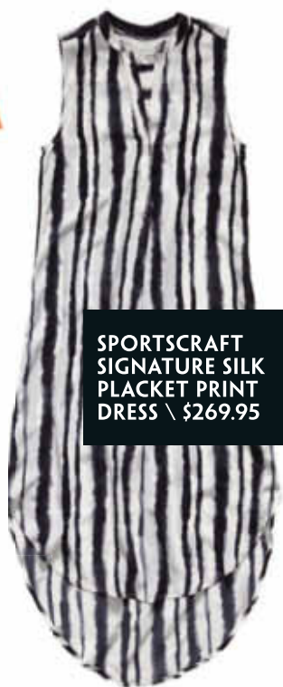
SPORTSCRAFT SIGNATURE SILK PLACKET PRINT DRESS \ $269.95