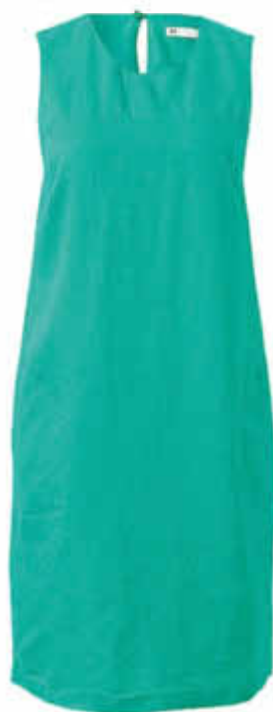
TARGET LINEN SPLICE SHIFT DRESS IN SPECTRA GREEN \ $35