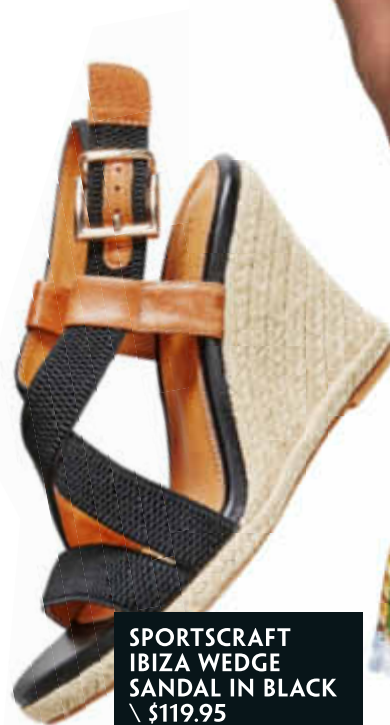
SPORTSCRAFT IBIZA WEDGE SANDAL IN BLACK \ $119.95