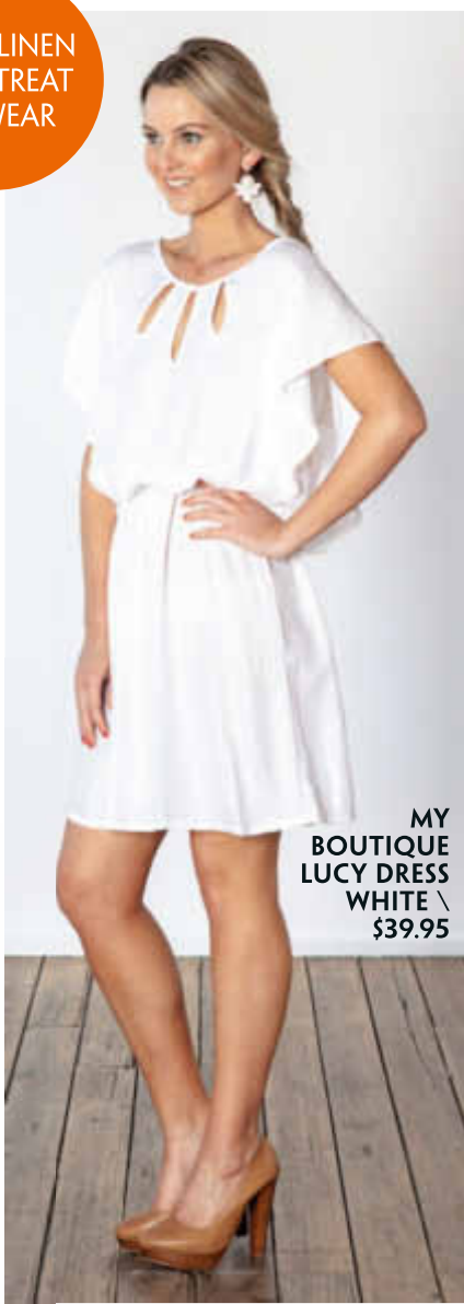
MY BOUTIQUE LUCY DRESS WHITE \ $39.95

STOCKISTS » Collette by Collette Dinnigan \ shop.collettedinnigan.com.au Cotton On Marketsquare \ 5229 2829 My Boutique \ www.my-boutique.com.au Sportscraft \ www.sportscraft.com.au Target Geelong \ 5273 0300 Witchery Geelong Malop Street \ 5222 2016