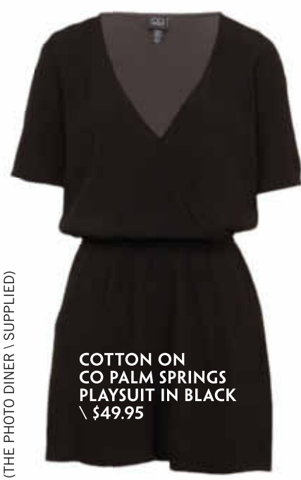
COTTON ON CO PALM SPRINGS PLAYSUIT IN BLACK \ $49.95