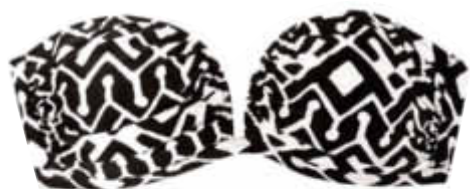
NEONTIDE MALIBU BANDEAU SET \ $79.95