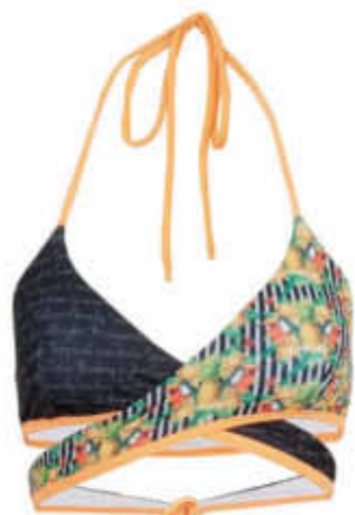
NU SWIMWEAR CARNIVAL WRAP TOP \ $109.95