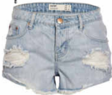
COTTON ON SATURDAY SHORT \ $34.95

There are plenty of sunny beach days to come this summer and autumn. Serious beachgoers understand that a day of sand and surf is best when you're well prepared.