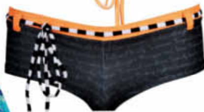
NU SWIMWEAR EXTRA HOT CHEEKY SHORTS \ $89.95